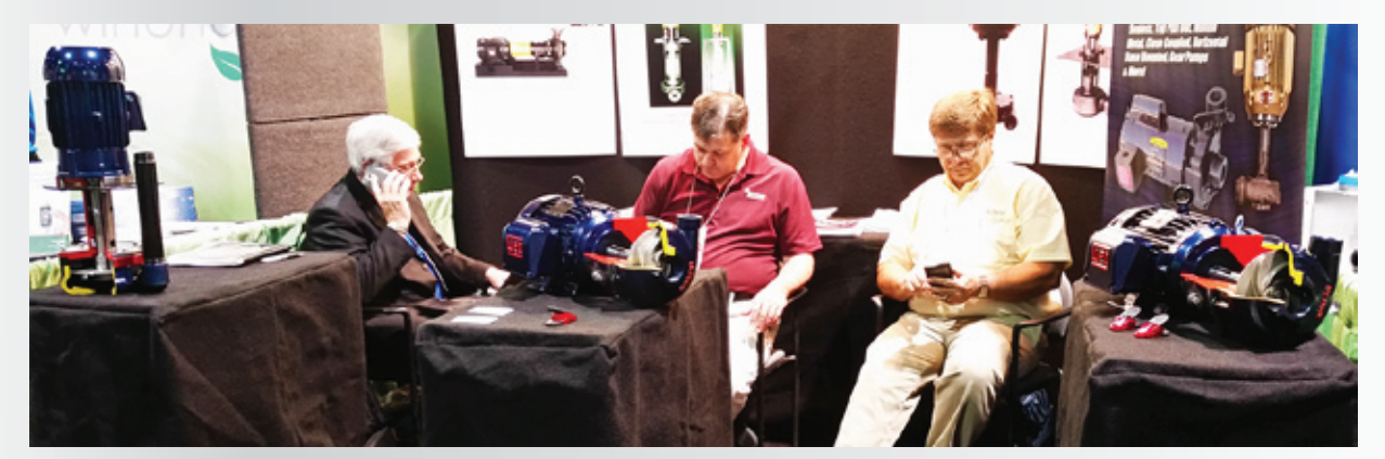
Manning the post at the Gusher booth.