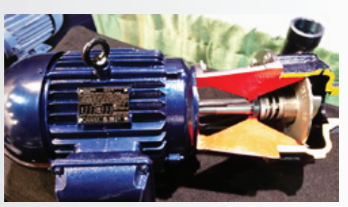
A work of art by Gary Smith...a Gusher V11019ah-se-a cutaway, specially engineered for dirty water service.

The Gusher Booth looking good at Clean 2015...set up and ready!