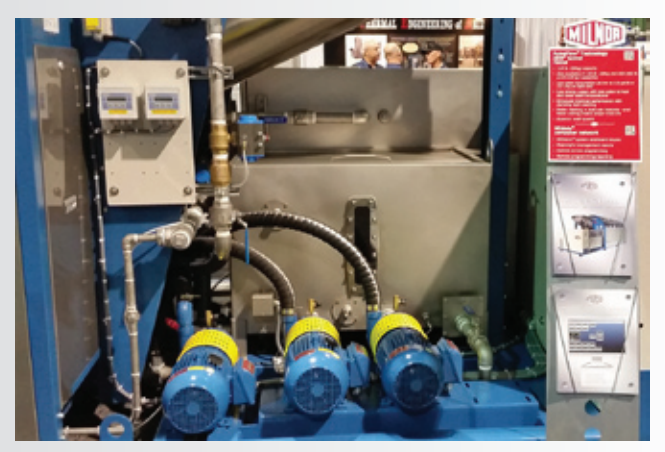
These three Gusher pumps are mounted on a tunnel drum commercial washing machine...featured at a Gusher customer's booth.