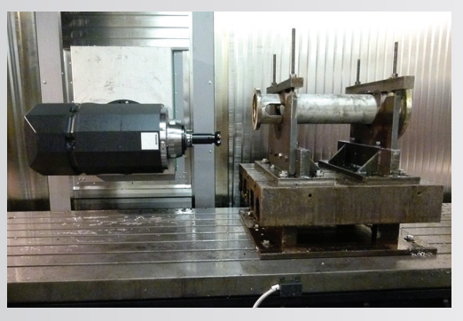
A perfectly milled column, in half the time with the Ibarmia system...