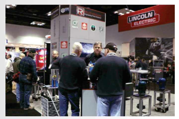
Gusher's Gary and Scott talk pump solutions with show visitors.

While parts washing is Ruthman's primary interest in PRI, this year brought some unique application possibilities in engine dyno pumps, diesel fuel transfer, and dirt track watering. The sales team is busy following up, quoting products from Ruthman divisions Gusher, BSM, PSI, and Fulflo.