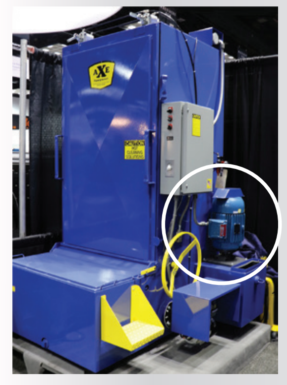
The motor of a Gusher 7800 series pump is visible on this Axe Equipment Spraywasher. Axe is a longtime user of Gusher Pumps, and one of many OEM customers exhibiting at PRI.