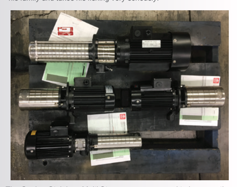
The Gusher Stainless Multi Stage pumps are used to increase the supply pressure for spray systems, water circulation, pressure cleaning, and a variety of other applications.