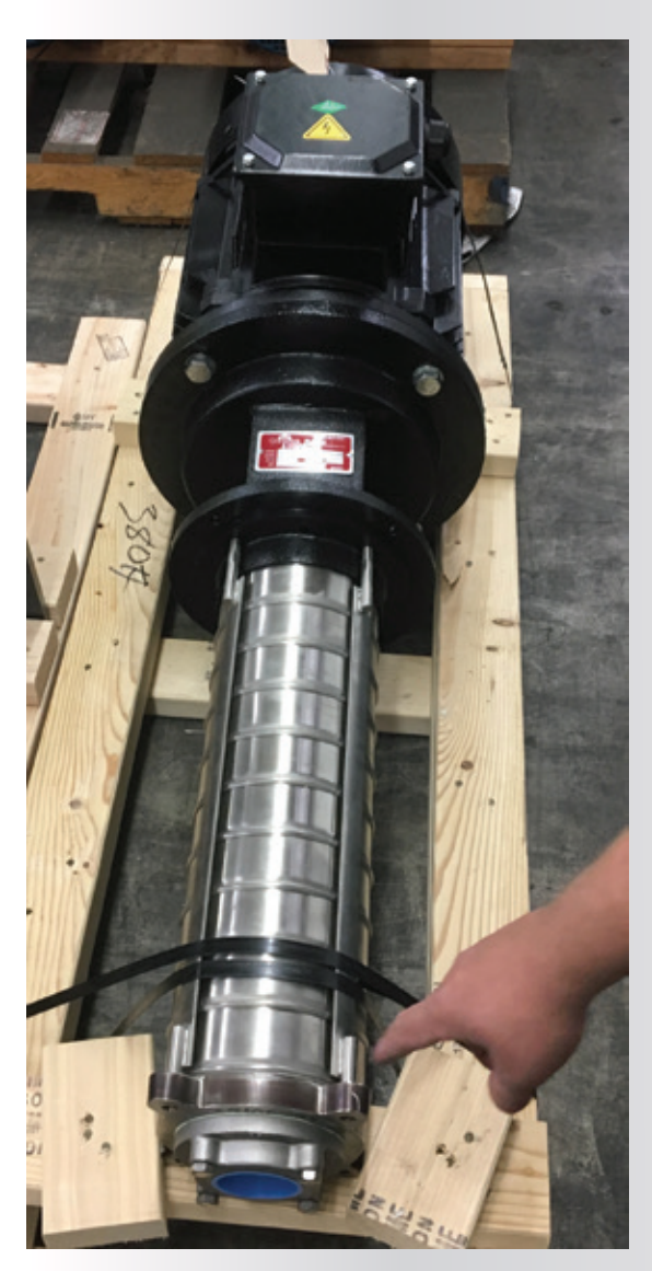
Clyde points out this custom discharge, added to this GMVCP model. A special stainless steel adapter was custom engineered at the Gusher factory for a customer's special intake application.

We recently visited with Clyde Caldwell who manages the Stamped Stainless series of stand-alone and immersible multistage pumps at Gusher Williamstown. Clyde has been focused on re-organizing the department to better control inventory. He enjoys the possibilities, variety and different applications of the line, and working with customers to solve their application challenges.