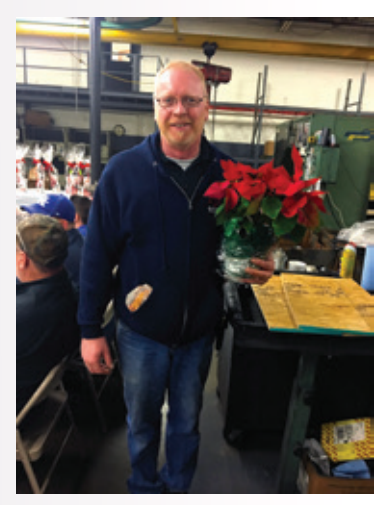
The poinsettias decorating the tables were raffled off, with one going to 'Joe the Tester'.