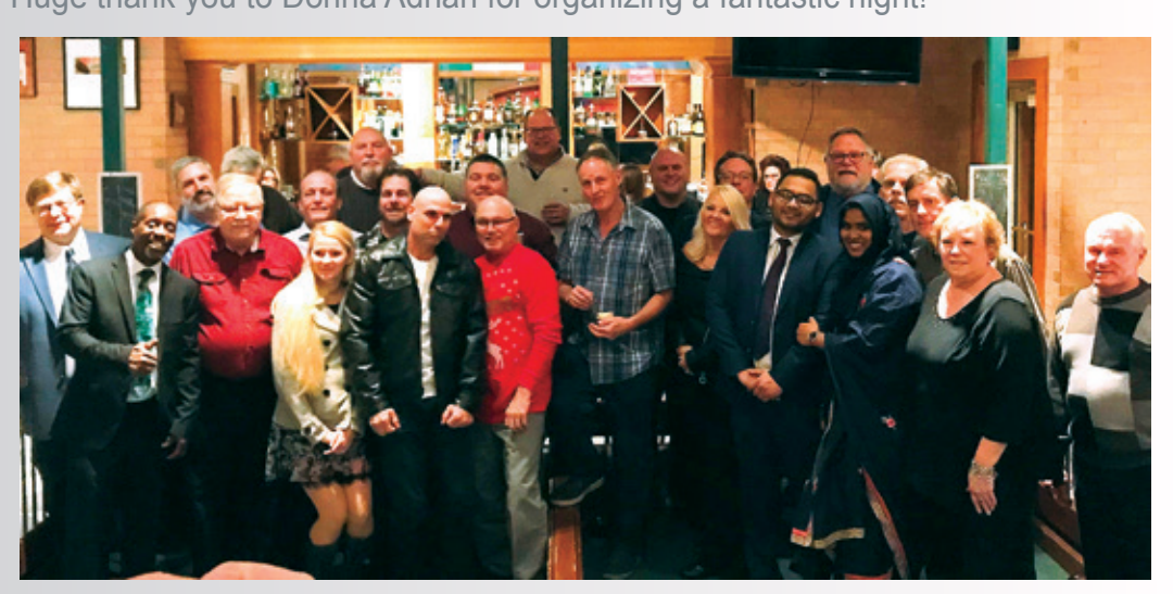
All three companies get together for a group photo.